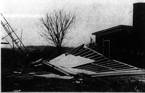
Gray debris deposited in his back yard.