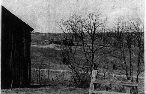
Barn demolished Barn demolished on the Livingood farm on the Gallows Hill Road.