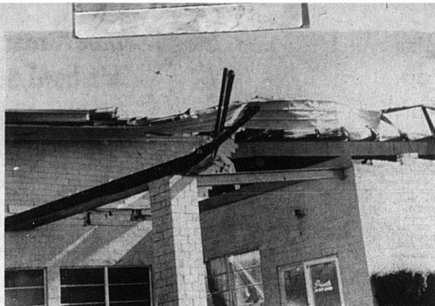
Close-up of BGK roof and front wall damage.

Although our lights were not out at home, many others were along the way. We were very thankful to be home, and to learn later that nobody was injured during this short, but expensive storm or small tornado.