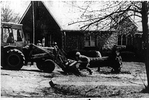
Street closed Eastern Avenue was non-passable Sunday as the city crew worked to remove two huge trees which had been uprooted and fell across the street.