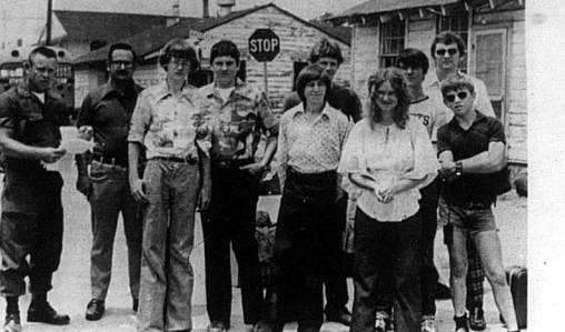
200 attend camp

records of sales warehouses where the crops were delivered. The Burley Association is anxious to get these checks into the hands of the rightful owners.