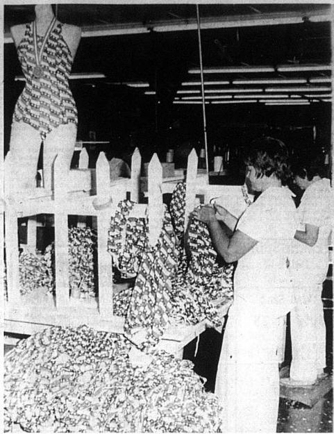
Suits for the general public

The swimwear you have been seeing largest contract manufacturer, pro- this week on television being worn by ducing men's and boy's underwear and the United States Olympic athletes was produced locally by Blue Grass In- BGI also manufactured the swim- suits that are being worn by the people in five plaits, is Kentucky's Canadian and Mexican teams this week. This is the second Olympics in a row that BGI has been responsible for the swimwear of the Olympic team. These suits are made of a new stretch lycra material, and will be available to the general public following the games.