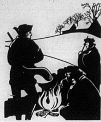
January, 1776. Washington's ill-clothed and hungry troops enter the Valley Forge, Pennsylvania.