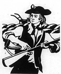
October 26, 1774. Massachusetts' militia purges Tory officers and the Minutemen are organized.