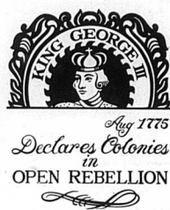
August 23, 1775. News of armed resistance prompts the King to proclaim a state of rebellion.