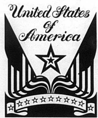
September 9, 1777. "United States of America" becomes the official name of the colonies.