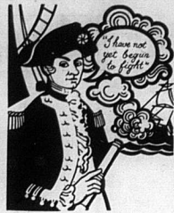
February 4, 1779. John Paul Jones takes command of his flagship, the Bonhomme Richard.