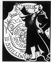
May 29, 1765. Patrick Henry declares "... if this be reason, then make the most of it."