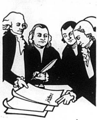
July 4, 1776. "The foregoing Declaration is, by order of Congress, engrossed and signed."