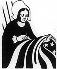
June 14, 1777. Second Continental Congress adopts specifications for the first U.S. flag.