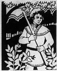
March 10, 1775. Daniel Boone leaves Fort Watauga, N.C. to open Kentucky for settlement.