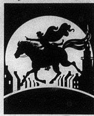
April 16, 1775. Paul Revere rides from Boston to warn Concord of imminent British action.