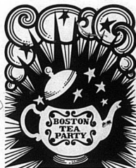
December 16, 1773. Led by Samuel Adams, colonists dump 342 chests of tea into Boston Harbor.