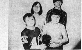
These Nicholas County 4-H'ers placed third in the Judging Contest held at the District Barrow Show and Sale in Paris.