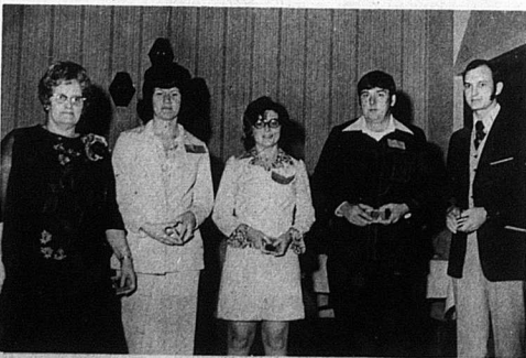
5 years service