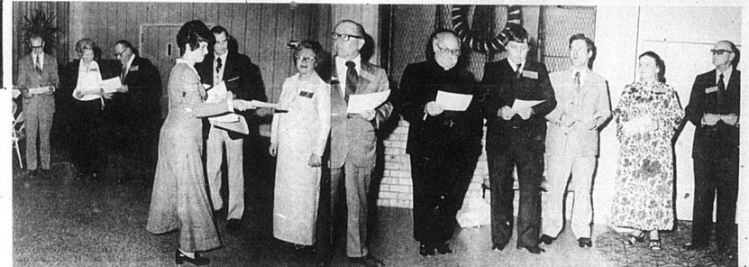
Employees honor board

Metropolitan Where the future is now Metropolitan Life Ins. Co. 96-11-11