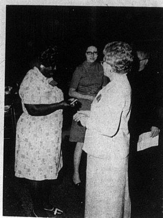
20 years service