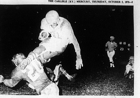
Friday night's game in which Nicholas upset Jessamine 21-6 proved to be filled with surprises, not only for the fans but the players as well.