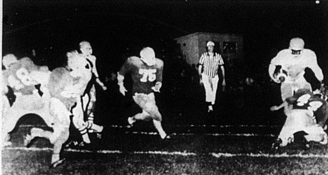
Good defense is what it takes and Deaf put up a battle both with the Bluejackets and the most hot Nicholas was the battle and the game, 40-0.