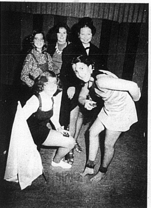
Those members of the Nichettes Batou Corp performing specialty acts during the baton revue Oct. 28 are: