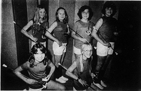
Nichette Review Oct. 28