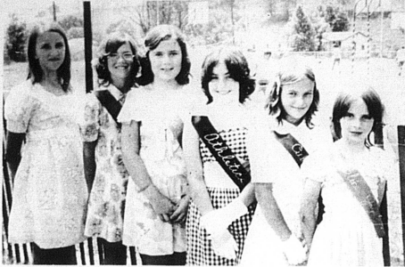
LL season opens Saturday