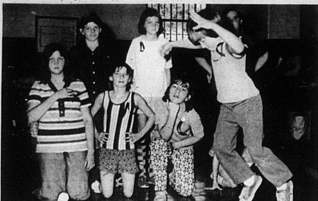
These Special Education students are enjoying a special Olympics Saturday morning at the Carlisle Army. The