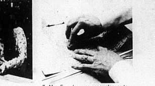
2. Mrs. Samples uses paper cleaner to remove surface dirt. Later, the paper will be treated chemically to remove acid.

State Archives now able to preserve Kentucky's oldest documents by lamination at the new document conservation laboratory in Frankfort, historic papers are cleaned, protected against acid in the air and are laminated with a transparent, flexible coating. After lamination they can be handled safely by researchers.