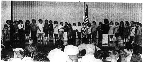
The 1974-75 Head Start program in May 29 at the elementary school. The Nicholas county presented a program Thursday night activity was a collection of things learned by the children throughout the year.