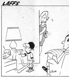
"The other team didn't show up. Something about periwigs."

Minor League Baseball Tournament being played this week. Reds and Cubs win first round games Monday night.