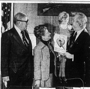
Heart Fund poster girl