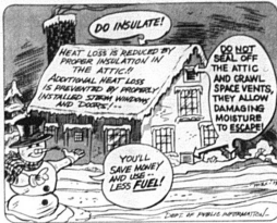
DO INSULATE! HEAT LOSS IS REDUCED BY PROPER INSULATION IN THE ATTIC. DO NOT SEAL OFF THE ATTIC AND CRAWL SPACE VENTS, THEY ALLOW DAMAGING MOISTURE TO ESCAPE! YOU'LL SAVE MONEY AND SAVE FUEL!

on some bills promptly once the session begins. Legislators will be encouraged to prefile even more bills for the 1975 session. Another rule change that is being considered would stop any bills from being introduced after the first 30 days unless they deal with an emergency. The Legislative Research Commission also is considering expanding its pre-session conference from three days to nearly two weeks and moving it from Kentucky Dam Village to Frankfort. The additional time will enable freshman legislators to receive a more complete orientation before the session. It also will permit both houses to elect their leaders and committee chairman early, so they can get down to business as soon as the session starts.