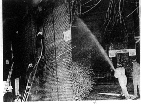
Members of Nicholas County Fire Department (at left) battle with a blaze that gutted the second floor of this building in Sharpsburg. Sunday night. At left are unidentified volunteer firefighters.