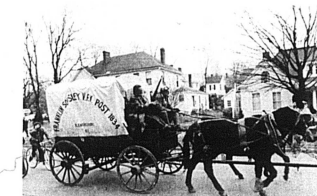
Horse-drawn carriage Several horse-drawn carriages participated in the parade on Dec. 9. This one was from the V.F.W. in Flemingsburg.