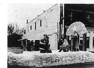
Parade Judge's Award winner The Parade Judge's Award went to total of 15 floats were entered in the Henderson County's entry on Dec. 9 parade.