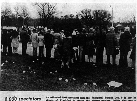
8,000 spectators An estimated 8,000 spectators lined the streets of Frankfort to watch the Inaugural Parade Dec. 9 in low 30 degree weather. Debris also was a by-product along the parade route.