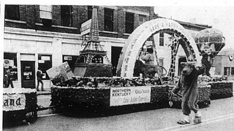
Over-all winner The overall-winning float in the parade—the Governor's Trophy—went to the Northern Kentucky Convention and Visitor's Bureau.