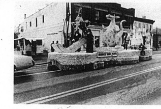
Commercial float winner This Kentucky Derby Festival entry Lady's Trophy during the float was the commercial division's first competition in the Inaugural Parade.