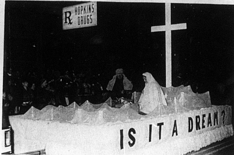
Third The Methodist Church Youth Group won third place for this float entry Thursday night. Various colored lights were visible under the cloud effect over the float.