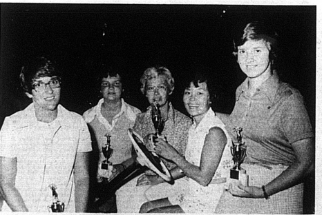
Earn second place trophies