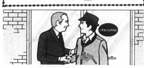
We're your most dependable source of long-term farm credit...