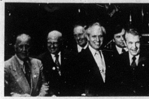
Makes history... First time in modern history...