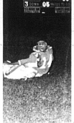
Gerald Thompson is tackled after carrying for a first down in Friday game against Jessamine County. The Jackets lost the game, 18-12—Don Smith photo.

Oct. 16: Submarine sandwich, French fries, green beans, fruit cup, chocolate chip cookies, milk. Oct. 17: Beef stew, tossed salad, peach half, cookie, cornbread. Oct. 18: Fish, butter beans, slow, applesauce, ice cream. Oct. 21: Barbecue on bun, tossed salad, French fries, cherry pie. Oct. 22: Ham, scalloped potatoes, peas, fruit salad, rolls. Oct. 23: Chicken noodle soup, potatoe cheese sandwich, crackers, orange, cookie. Oct. 24: Spaghetti, peanut butter on crackers, slow, pear half, muffin. Oct. 25: Fish, macaroni and cheese, slow, peach half, ice cream. Oct. 28: Wiener on bun, slow, French fries, pear half, brownie.