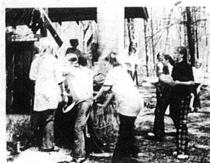
Water fight whets appetite