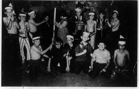
Kindergarten. Class of 1974