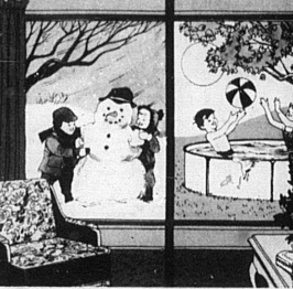
It's wise to use electricity...use it wisely!