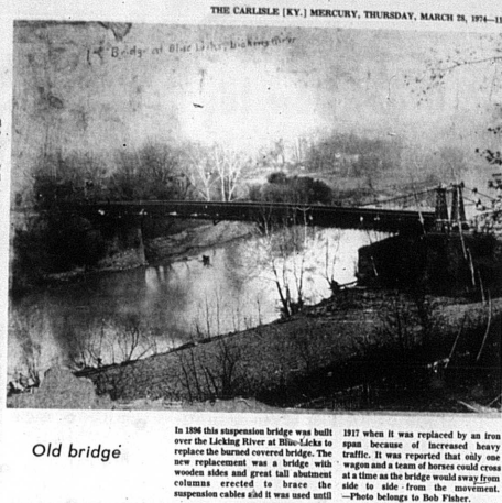
In 1836 this suspension bridge was built upon the Licking River at Blue Licks. In 1917 when it was replaced by an iron span because of increased heavy traffic, it was reported that only one wagon and a team of horses could cross side at a time as the bridge would sway from side to side from the movement.