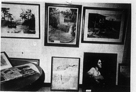
Pictures from The Kentucky Bicentennial Art Display at the library. The display will be at the library all week.