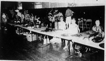
The Nicholas County Homemakers show local arts and crafts at the army Monday.