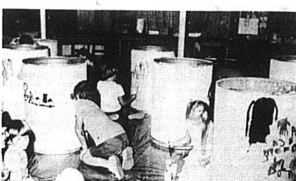
Fun barrels The Carlisle Junior Woman's Club sponsored a barrel painting contest for children five to eight years of age. Painting was done Saturday, June 22.

House, won first place in Monday night's Bicentennial Parade.