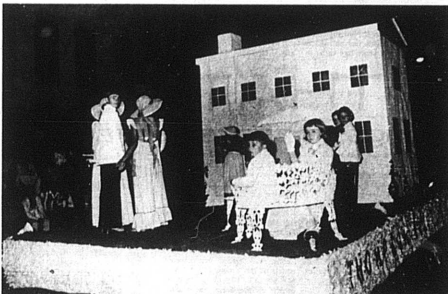
Winning float The Theobred Club of Blue Grass Industries, sponsoring the Thompson