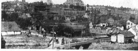
View of Carlisle June 10, 1905.