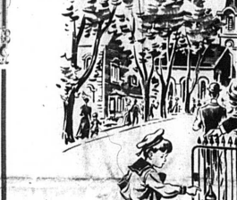
NICHOLAS COUNTY, KENTUCKY.

my head and answered, "Yes, it does!" I could say no more because it seemed to me the Old House had been deserted and forgotten, but the two men who stood there, surrounded by emptiness, remembered. I hope that some person or group of persons will purchase the "Old Stone House" and renovate it, so that it might stand forever as a shrine and a beacon