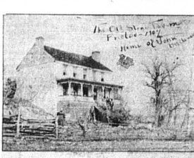
NICHOLAS COUNTY, KENTUCKY.

History of the Old Stone Tavern The Old Stone Tavern was built in 1817 by James Ellis, a Revolutionary War veteran. The venerable building stands near the side of the road, which is now Route 66, Elliptical, the county seat of Nicholas county. The courthouse stood directly across the road from the tavern; the wall that was up on the hill, behind the courthouse. The tavern served as a waystation for those who traveled; what was then called Smith's Wagon Road. Many weary travelers, among them notables, who traveled by stagecoach and horseback, foundered and rest in the tavern. Kentucky, was then, in her tender years; and the people who