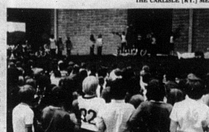
As a culminating activity for an ecology unit studied earlier in the spring, Phase II of the Nicholas County Elementary School presented an ecology play on May 23 entitled "Earth is for All." The children attempted to portray the idea that if this earth is to be preserved, all living things—plants, animals, people must cooperate to keep it beautiful.