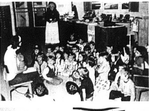
Children's Story Hour