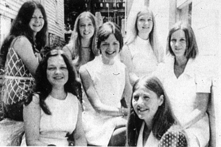
Another pretty selection of queen candidates were on hand Monday night, July 1 for the opening night parade at the American Legion