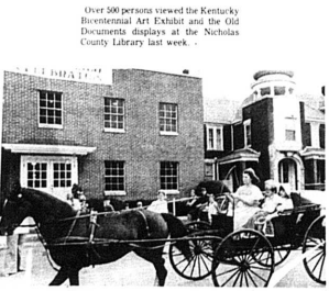
Beggy tours, sponsored by Senior Girl Scout troop 170, were a big hit on Wednesday and Saturday