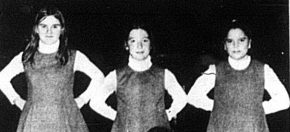
LL Basketball scenes taken during regular season play.