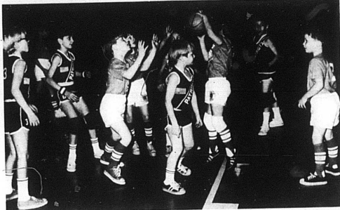
No one left out

This is a scene from one of the Carlisle Jaycees Little League games last year in which the "little boys" are playing. The "little boys" play for three minutes of the