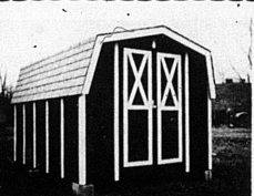
For Sale: Red barn buildings 8 ft. x 8 ft. and 8 ft. x 12 ft. Complete. Ready to use. Canino camper truck tops in stock.