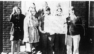
Girl Scout Senior Planning Board Officers.