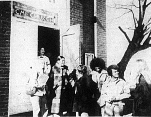
Local Troop 271, greeting board members.

Nov. 17, Girl Scout Troop 271, of Carlsle, hosted the Wilderness Road Council's Senior Planning Board. The Senior Planning Board is comprised of two representatives from every senior troop in the council which meets every month to plan council wide activities for the Girl Scouts.