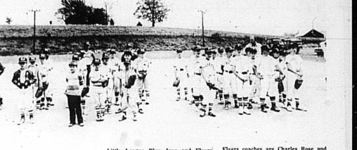
Blue Jays and Flyers

Chrysler Town & Country One of America's most luxurious wagons. It's big, comfortable, with a plush interior and lots of storage room. Find out how easy it is to own it.