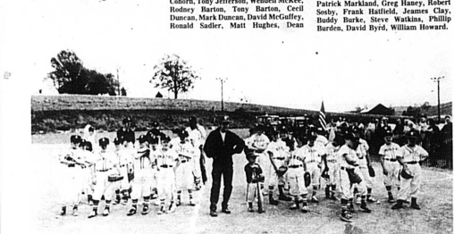
Athletics and Redlegs