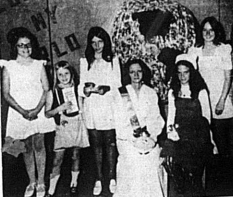
Blue Grass Area 4-H Fashion Revue winners