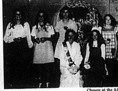
State Fair winners