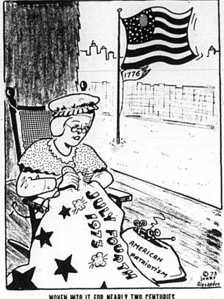
WOMEN INTO IT FOR NEARLY TWO CENTURIES