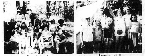
Junior Camp Council and directors

Girl Scout Day Camp was held June 18-20 on the Morford farm near Lake Carnico, 65 girls, 4 senior aides, 8 aides and 18 adults attended the camp. Camp opening each morning and closed each evening with singing and a flag ceremony conducted by the girls. The Juniors and Cadettes stayed overnight one night preparing all their meals and using many kinds of outdoor-cooking techniques. The lake area offered the opportunity for all the units to enjoy fishing.