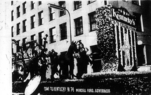
COME TO KENTUCKY IN '74 WENDELL FORD, GOVERNOR

It is also appropriate to let your heart bleed for yourself as you visit the vegetable counter in your super market.