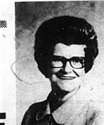
Celebrates 25th anniversary