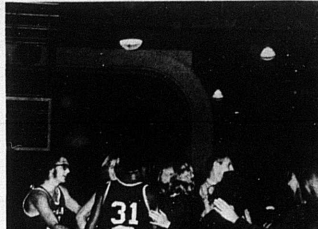
Bluejackets and their cheerleaders celebrating their 65-59 thirteenth year Silver Grove in the first round of the Augusta Tourney. The Jackets went on to the final where they were dumped by host Augusta 66-44.