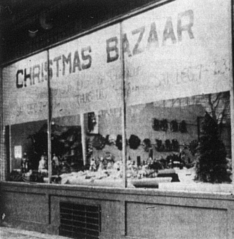
This tableau of Christmas goodies is being offered for sale Saturday, Dec. 2, from 7 a.m. to 2 p.m., and at later dates also, provided there are enough items left. The Christmas Bazaar is being sponsored by the women of the Shrine of Our Lady of Guadalupe. Items to be sold include Christmas decorations, ornaments, tree skirts, table and door decorations, candles, gift items are aprons, towels, baby gifts, gloves, teddy bears, homemade fruit cakes and candies.

December 18 is the deadline for receiving entries in the 1973 National Farm Machinery Show Tractor Pull at the Kentucky Fair and Exposition Center in Louisville.