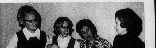
Christina Bazaar December 2