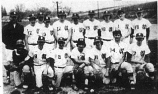
Nicholas County Baseball Team