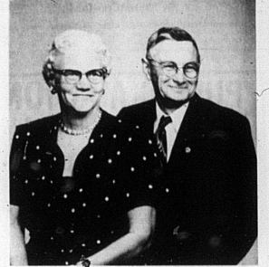
Couple to celebrate Golden Anniversary