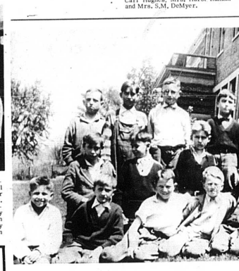
Can you name these boys? Is it an all male class, what's the occasion for the picture?