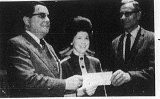
Trip for two

Dougherty Lodge No. 65 FRAM will meet at 7:30 p.m. Feb. 11. Initiation in the E.A. degree will be presented.