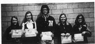
High school winners