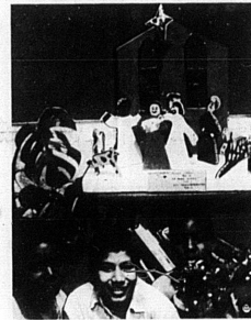
Career and his makers, all three boys bring midgets at the Harlan Art Carnival. Their materials were double-weight cardboard, paint, and glue. A bit of collage was part of their technique in creating this traditional Christmas decoration.

Get someone to take a picture of the youngster showing him or her holding or using the gift. Then get him to write just a few words of thanks on a piece of paper or the photo itself. Grandma or Uncle, is sure to be doubly pleased!