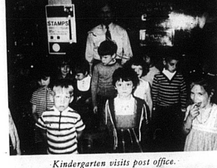
Kindergarten visits post office.

Kindergarten visits library during Library Week.