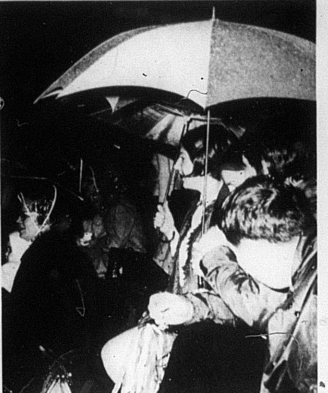
Loyal Fans These people traveled to Mt. Sterling to sit in the rain in support of the Nicholas County Bluejacket football team Friday night.

Whether to add a new section which would permit Congress to exempt women from the draft and retain U. S. and State laws promoting health and safety. Ayes 87, Noes 263, Rejected, Oct. 12. Whether to pass H. R. 208, Year 354, Nays 23. Passed, Oct. 12.